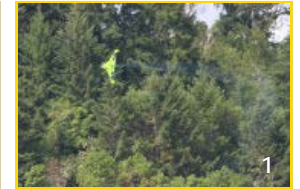
Larry Myers always teases the trees and once again he evaded their evil clutches.