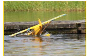
Larry Myers and Corey Myers are both flying J3's. The only difference is the color of the Starbursts.