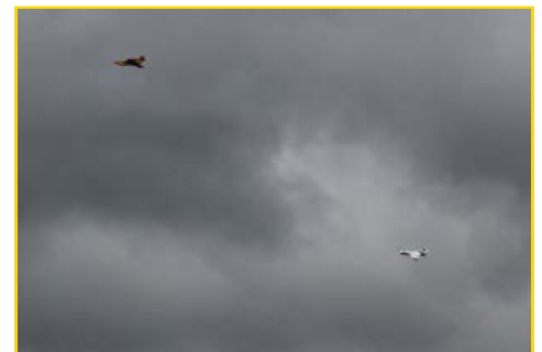
NorthStar air commandos playing tag at 90+ mph across a roiling sky!