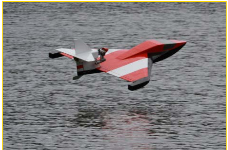
This NorthStar has half the covering missing from the left wing! He made a smooth landing too.