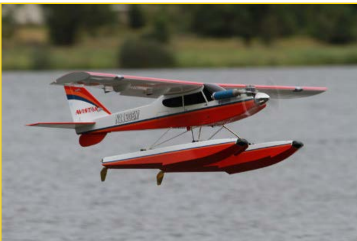
Notice the flaps down and slick servo water deflectors.

This is a model called an "Antic" built by Bob Hoover who hails from Keiser, Oregon. It is a Procter kit with a 72" wingspan that took 6 months to build. Bob is using a Saito 90 four stroke. It currently has 24 flights in the log book and is a remarkable flyer.