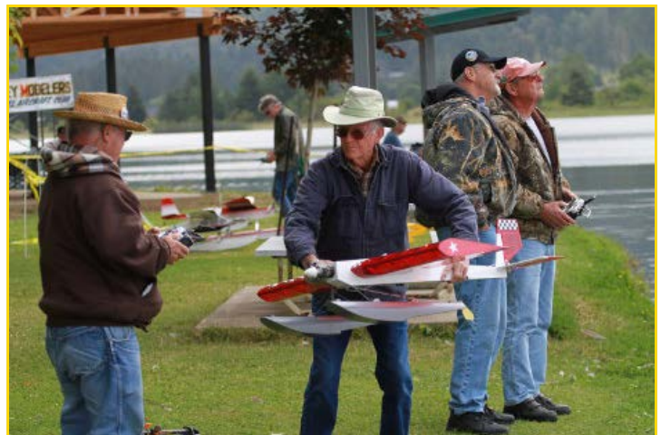
These gentlemen are flyers from the Umpqua flying club. This is the club that ran this year's Platt 1 float fly.

The variety of float planes always amazes and is one of the treats one finds at larger gatherings. There did seem to be four major categories. First of course are the cubs of all sizes: