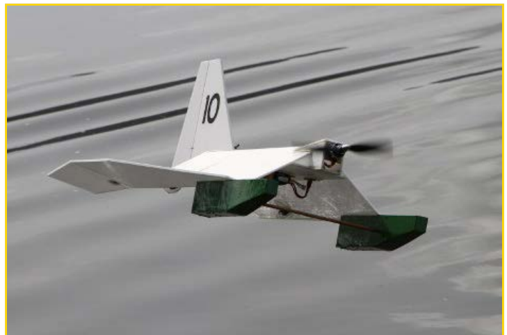
The Flying "W" ?

Finally, Kudos to the Rogue-Eagles for taking up retrieval boat duties when they saw a need. Here is Larry Myers, one of several Eagles who rescued many downed airplanes instead of waiting. We all appreciate their efforts and they perhaps saved even further damage.