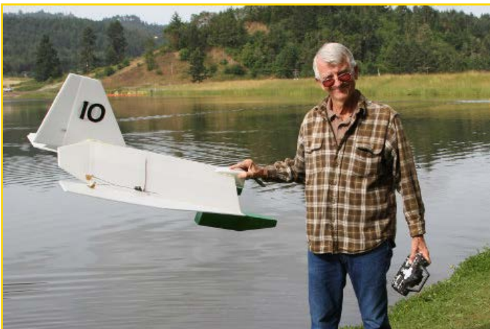
The Strangest Plane award goes to this gentleman who shows up every year flying this... er... interesting apparition.