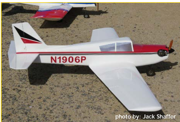
Here's a unique vintage model, a Comanche built from a kit produced by Hot Line Models of Amarillo, TX. Jason Snyder brought it out, but didn't fly because he thought the un-muffled engine might be too loud. Sleek!