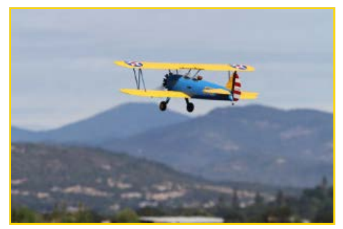
Forrest Waller (son) flies the Stearman. This is a good example of a scale model that is VR/CS eligible. It has nothing to do with the scale subject - not all Stearman models qualify for VR/CS. What determines eligibility is the date of the model design. This was built from a Sterling kit which dates back to the 1960s. More modern kit and ARF designs like those from Balsa USA and Great Planes do not qualify.