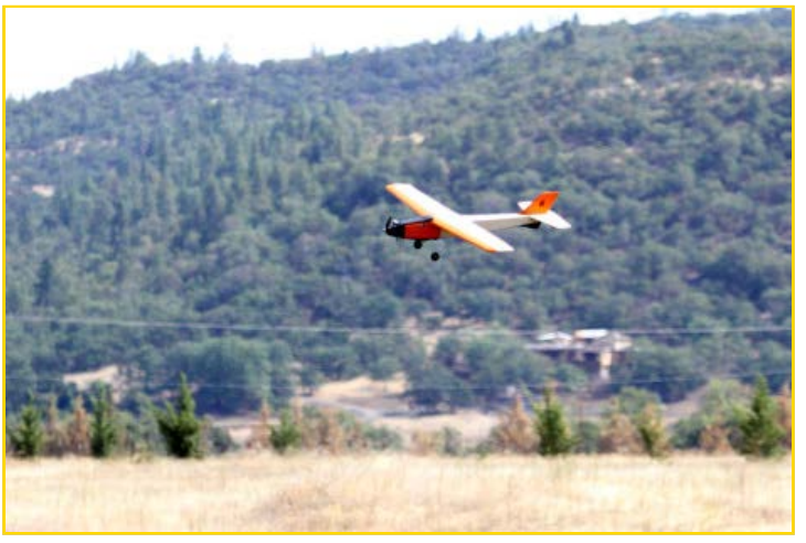
The Harold Hayes Special glides in for a landing. Model was flown until its Cox .051 ran out of fuel.