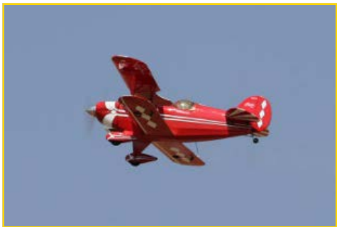
Alan Littlewood's Pitts.