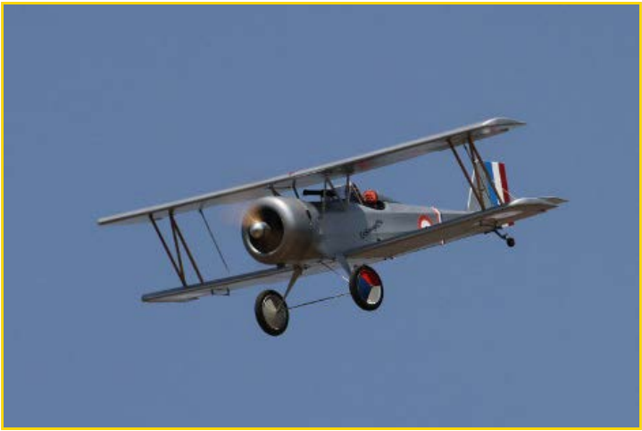
Here is Cliff Sands Le Savage Goose...