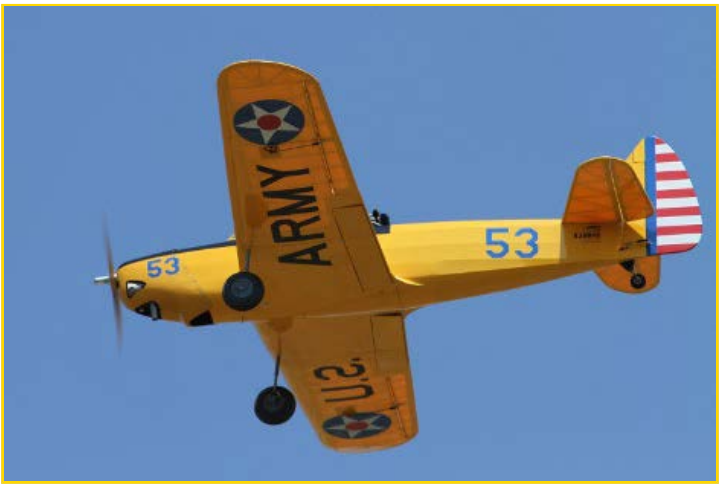
Paul Starks' PT19, SCRATCH BUILT!