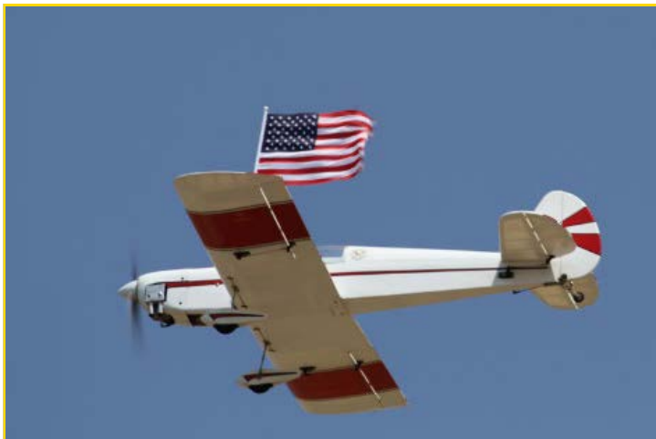
Flying the colors.