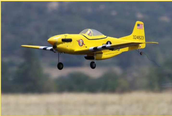
Corey Myers' nifty Mustang.