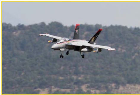
Larry Cogdell's F-18 Super Hornet