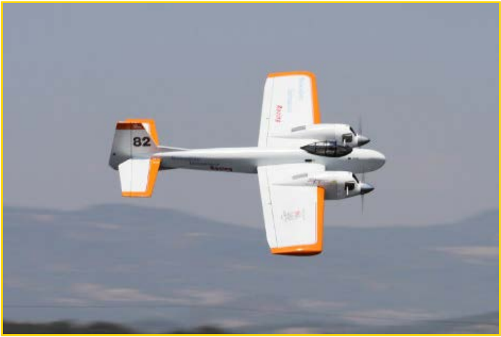
Fred Sargent helps launch Cliff Sands' very fast twin.