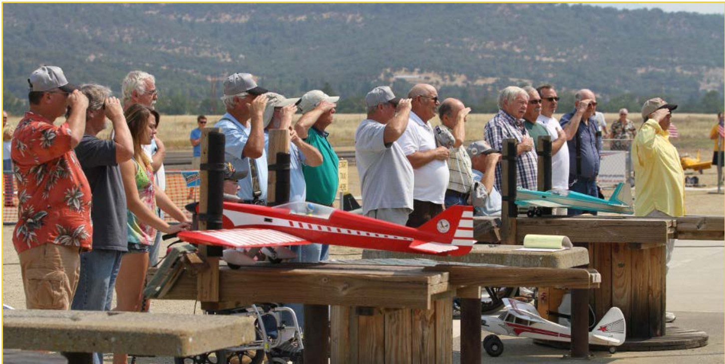
Honoring our veterans during the National Anthem and the raising of the flag.