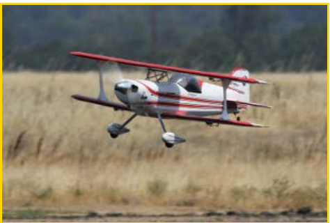
Calvin Emigh's Pitts.