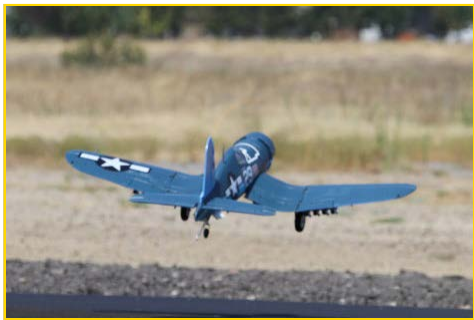
Mort Sullivan's Folding wing F-4U Corsair