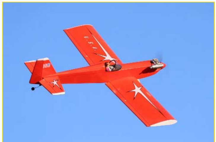
Guys tend to bring out their trusted friends and nothing spells trusted better than a good old Four Star... always a good choice to begin the year.