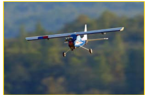
There is always some drama when model airplanes are flown and this year's award goes to Larry Maerz here flying a plane that went up with three wheels but is coming down with only two.