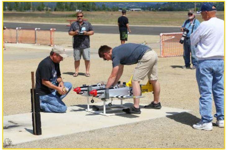
Troubles with Super-Tigers (they did get them both running and had a fine flight).