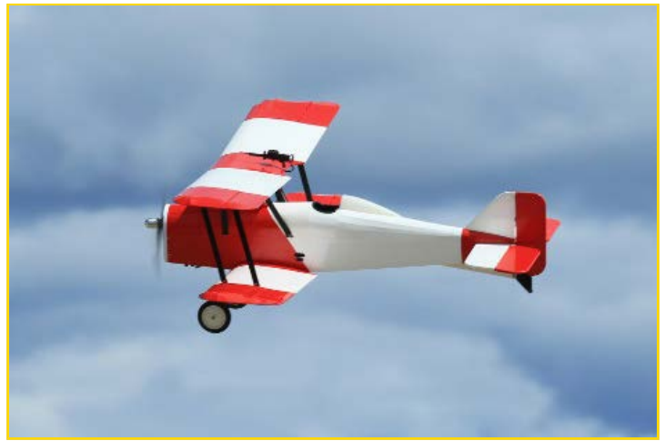
A pilotless SE5.