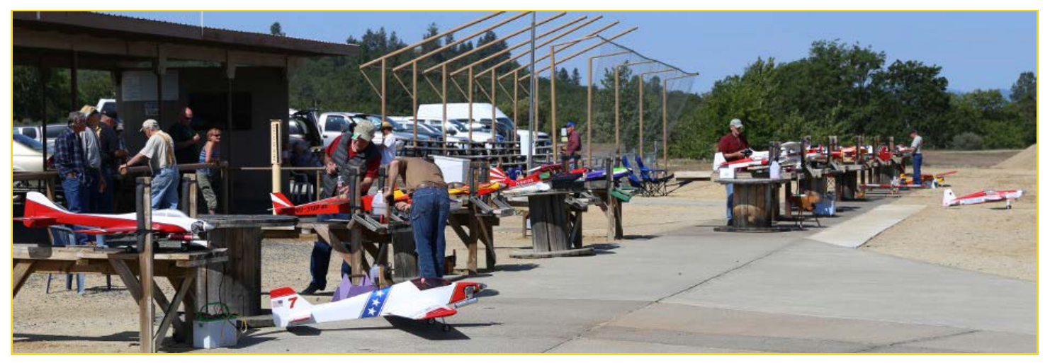
We definitely had a full airport as all of the airplane stands were being used by upwards of forty flyers.