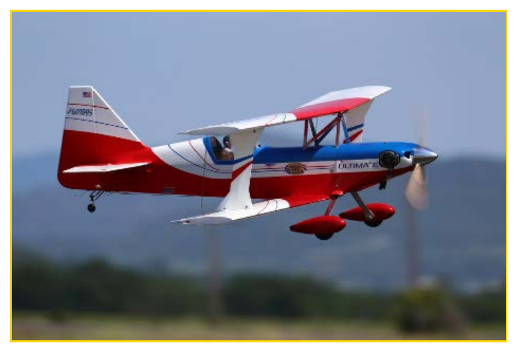
John Parks was flying the wings off of this beautiful Ultimate. The YS 1.20 is a very potent engine in a plane of this type.