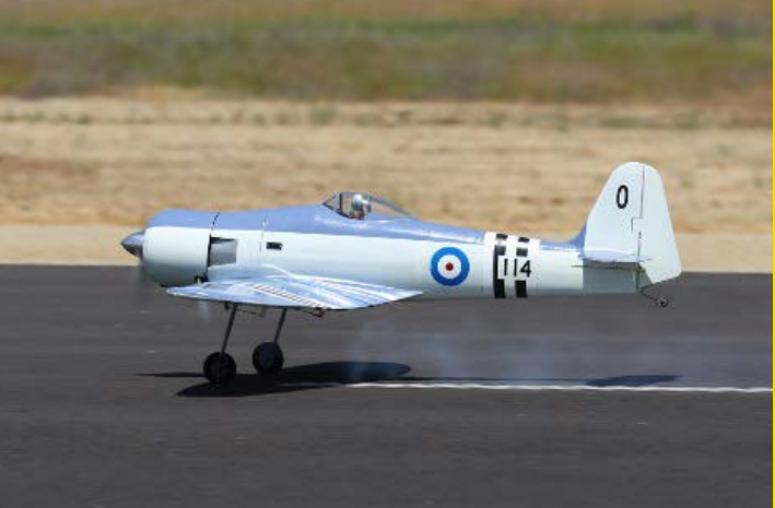
Alan Littlewood's Sea Fury on final approach and just before a perfect touchdown.