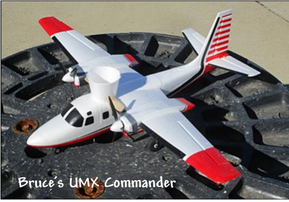
Bruce's UMX Commander