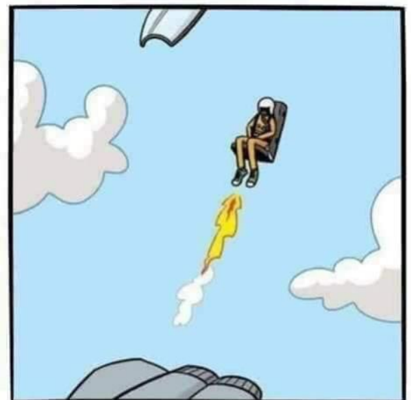
On one hand it was a 40 million dollar plane, on the other hand the spider was inside the cockpit.