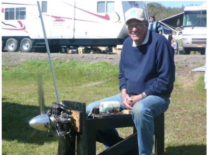
Cliff, did the FAA approve this?

The best landing procedure is to hold the aircraft off the deck a foot high with idle power and try “not to land.” The airplane will slow and “sink in” in spite of you, giving you a smooth transition from air to ground.