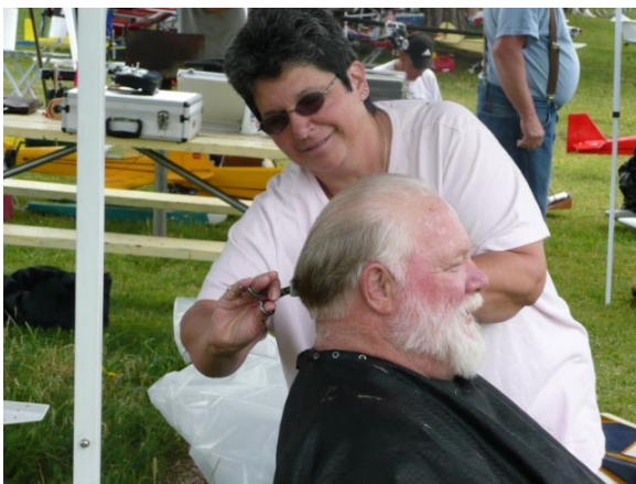
Haircuts were available at the Plati Lake Float Fly!