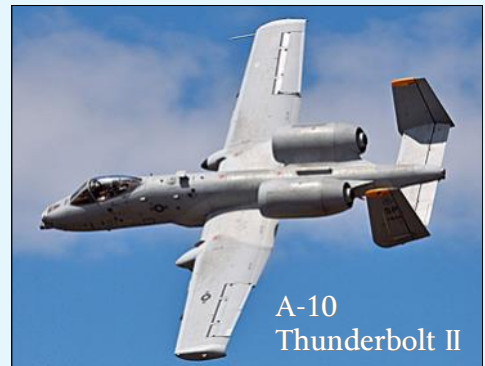
A-10 Thunderbolt II