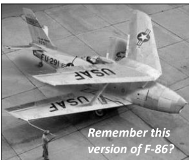
Remember this version of F-86?