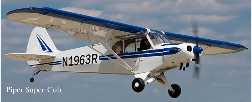
Piper Super Cub

You may remember this topic from last month's newsletter. Members were asked to submit their own lists, and here are the ones that were received. Thanks for sharing guys!